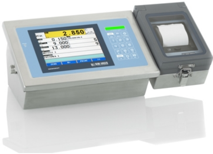
3590EGT with IP65 INOX printer